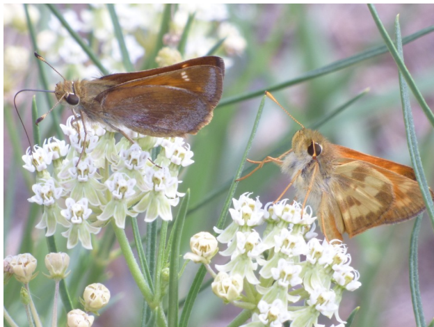
2 Taxiles Skippers F, M; she's sipping