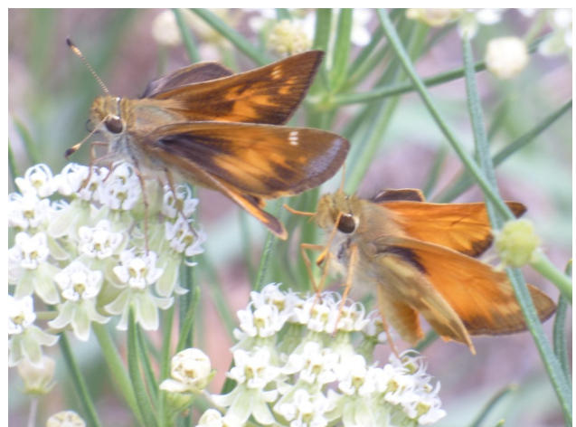
with wings unfolded he's advancing

Sadly, upon returning later I discovered this lively congregation mowed to dusty earth.