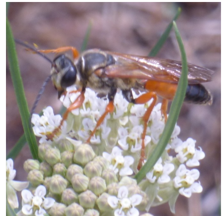
a Great Golden Digger Wasp