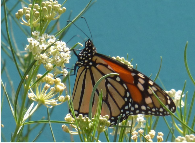
a Monarch butterfly , seldom seen here

On July 12-17 bordering the Riverwalk north by the Blue Bug Wall appeared a lovely patch of Poison Milkweed, poisonous only if you eat the plant not if you merely sup a bit of its nectar.