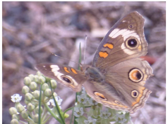
a Buckeye, never before seen here