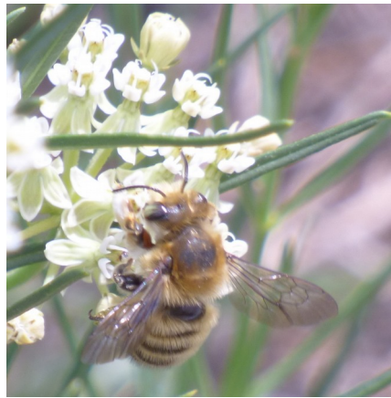
a busy buzzy bee